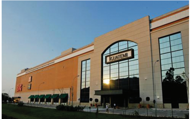
Fig. 22 - Shopping Iguatemi

• Shopping Iguatemi 28 : offers 200 shops and 7 movie screens. In fact, it hosts one of the largest cinema screens in Brazil, with a modern stadium seating style.