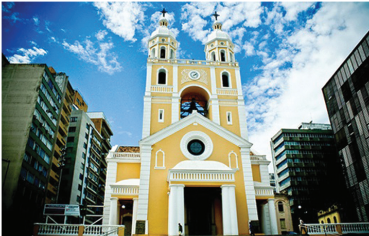
Fig. 14 - Metropolitan Church