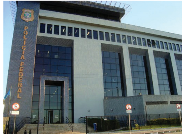
Fig. 8 - Building of the Federal Police

To pay these fees the student should access the website < www.dpf.gov.br > and follow these steps: