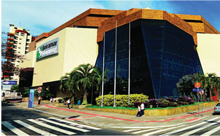
Fig. 20 - Shopping Beiramar