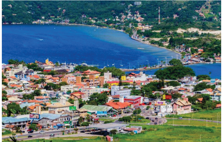
Fig. 11 - Lagoa de Conceição

• Lagoa da Conceição: The Lagoon known as Lagoa da Conceição is close to some of the island's best beaches, namely Praia Mole beach and Joaquina beach, both of which have hosted major international professional surfing events.