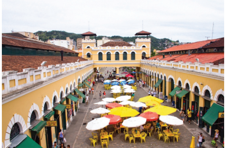
Fig. 15 - Public Market

• Municipal Market: Formerly used as the city market place, this downtown shopping area in Largo da Alfândega still holds some interesting sights. It has a varied commerce, especially clothing, food, utensils and various crafts. Moreover, it is an important meeting point and leisure area of the city, both for locals and for tourists. It was built in 1851.