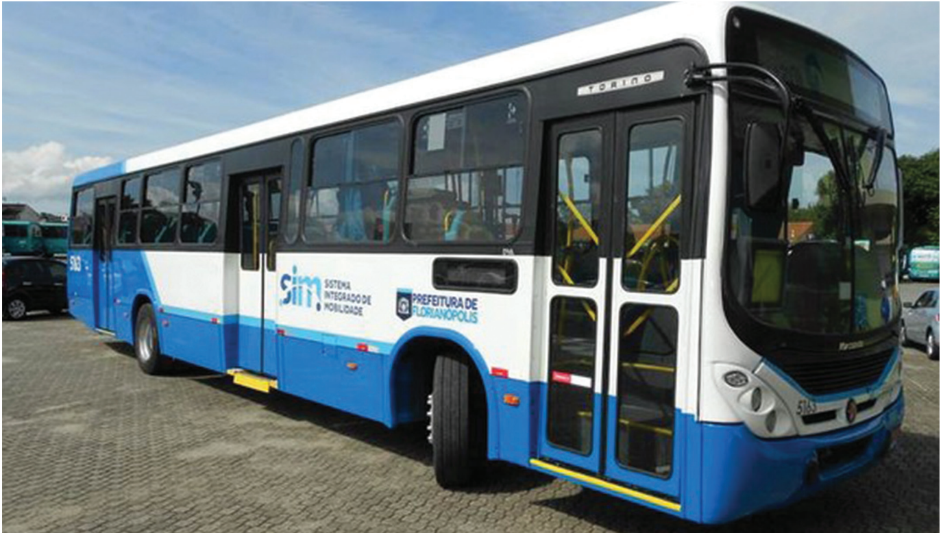
Fig. 10 - Florianópolis Bus

The bus transportation system in Florianopolis has 6 integration terminals “terminais de integração” operating within the city, wich are: