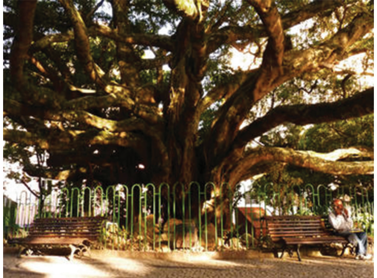
Fig. 19 - Velha Figueira – Praça XV

• Velha Figueira: This \geq 100 year-old fig tree can be found downtown in the main square Praça XV de Novembro and it is honored in the official municipal hymn of Florianopolis.