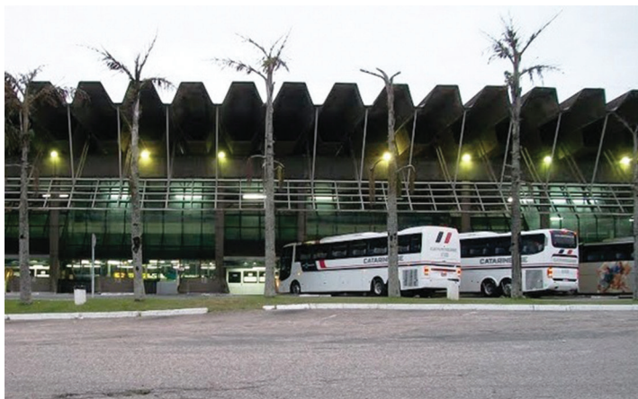
Fig. 3 - Rita Maria Bus Terminal