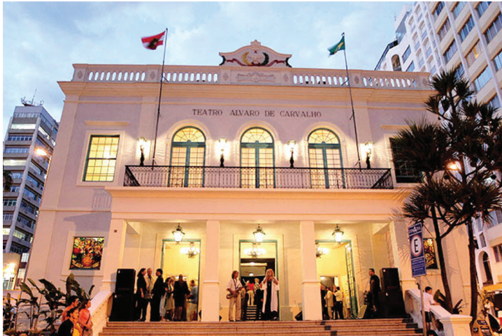
Fig. 17 - Álvaro de Carvalho Theater

• Teatro Álvaro de Carvalho (Álvaro de Carvalho Theater): Located in the city center, the Municipal Theater is an example of 1870's local architecture.