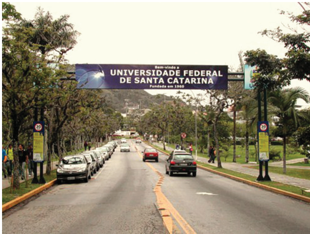
Fig. 4 - UFSC entrance

After arriving in Florianópolis, there is a series of essential steps which will ensure the success of the exchange program at UFSC. Our team will provide support, if necessary.