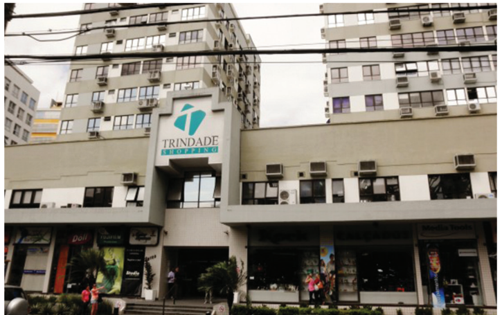
Fig. 23 - Shopping Trindade

• Shopping Trindade 29 : Closest to UFSC and offers a variety of services, shops and a food court.