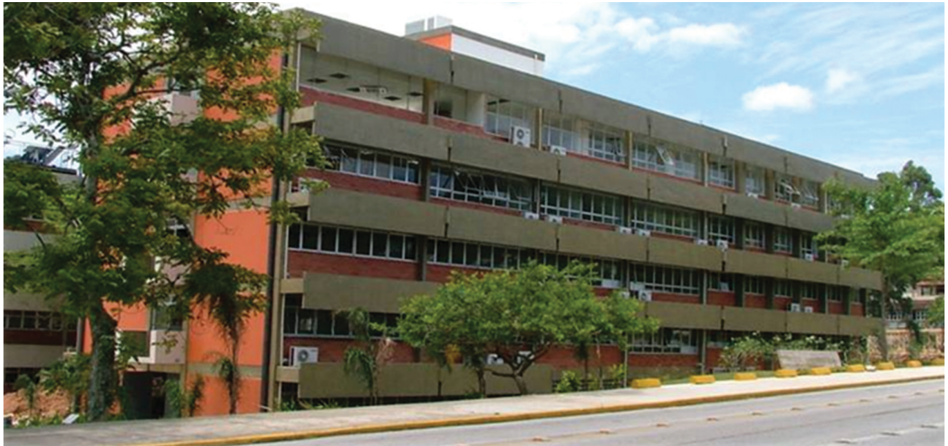
Fig. 2 - POLO building

With the support of the Department of Mechanical Engineering, POLO has developed more than 30 years of uninterrupted partnership with EMBRACO Compressors, a leading company in the field of household and light commercial refrigeration compressors. This partnership, which has also been continuously supported by Brazilian government agencies for promoting research and advanced studies (FINEP, CNPq and CAPES), has allowed the Federal University of Santa Catarina (UFSC) to establish itself as a reference for research in the field of refrigeration. As a result of the high-quality research conducted at POLO, other partnerships with large companies such as Whirlpool, Bosch, Electrolux, Metalfrío, Embraco, WEG and Petrobrás have been consolidated over this period.