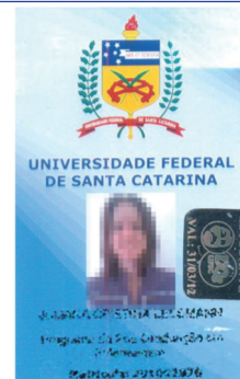
Fig. 7 - UFSC ID Card

The UFSC ID Card is a student identification card. The UFSC ID gives the student permission to use the university restaurant (RU) and the library. Students can obtain UFSC ID Cards at the RU Administration - they will need to present their registration statement ( Atestado de Matrícula ) provided by SINTER and their passport (undergraduate students). Master's, doctoral and post-doctoral students must present their enrollment certificate provided by POSMEC and their passport. In Brazil, students are entitled to pay half price for many cultural events, such as concerts and movie theaters. The UFSC ID Card together with the registration statement can be used in this case to confirm student status.