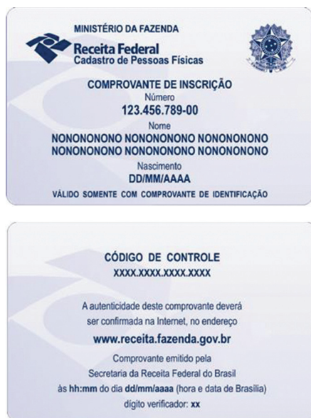
Fig. 9 - Front and back of CPF card

The CPF - Certificado de Pessoa Física (Individual Taxpayer Identification Number) relates to a database managed by the Federal Revenue Service of Brazil (RFB), which holds a registry of information on taxpayers required to have a CPF number, and citizens who have voluntarily signed up.