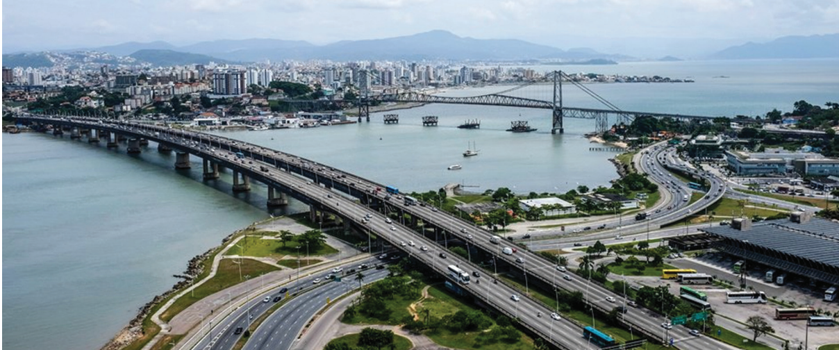
Fig. 1 - Overhead view of the Florianópolis bridges

Florianópolis (Portuguese pronunciation: [flori.a'no polis] is the capital city and second largest city of Santa Catarina state in the southern region of Brazil. It is composed of one main island, the Island of Santa Catarina (Ilha de Santa Catarina), a continental part and the surrounding small islands. It has a population of 421,203, the second most populous city in the state (after Joinville), and the 47 th most populous in Brazil. The metropolitan area has an estimated population of 1,096,476, the 21 st largest in the country. The city is known for its very high quality of life, being the Brazilian capital city with the highest Human Development Index score (0.0847). The economy of Florianópolis is heavily based on information technology, tourism and services industries.