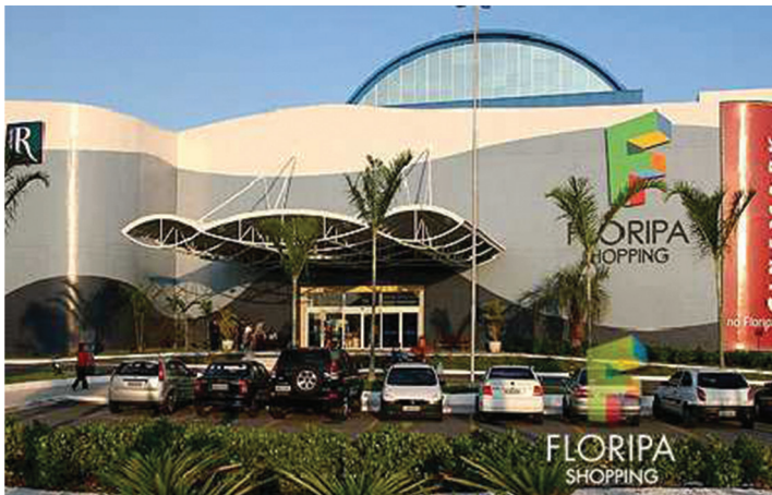
Fig. 21 - Floripa Shopping