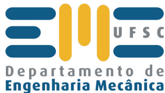
Fig. 6 - Logo of the mechanical engineering department