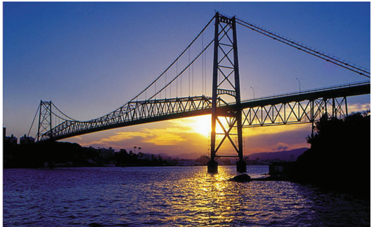
Fig. 16 - Hercílio Luz Bridge

• Hercílio Luz Bridge: The postcard symbol of the city, inaugurated in 1926 linking the island to the mainland.