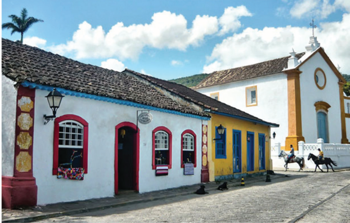
Fig. 13 - Santo Antônio de Lisboa