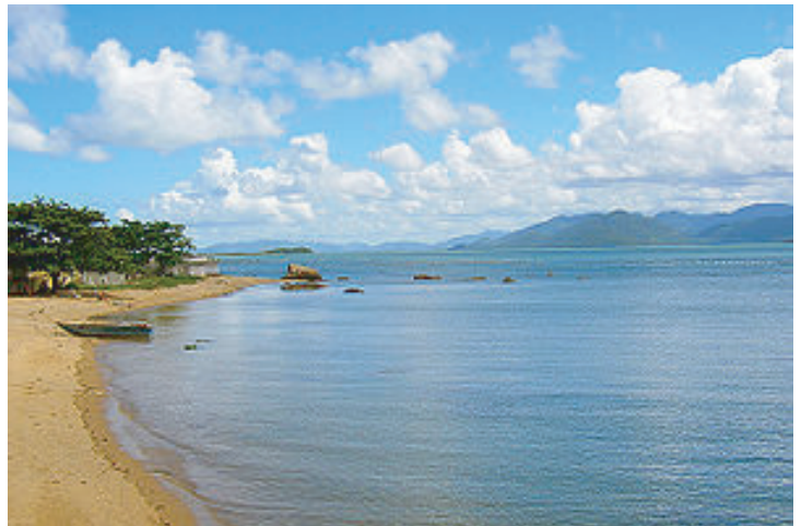
Fig. 12 - Ribeirão da Ilha

• Ribeirão da Ilha: 36 kilometers from the city center, this old district of Florianópolis is a testament to Azorean immigration. Its historic center, in Frequesia, has a square where the church Igreja Nossa Senhora da Lapa do Ribeirão is located, and the Ethnological Museum houses documents and relics from the region's history.